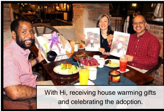
With Hi, receiving house warming gifts and celebrating the adoption.