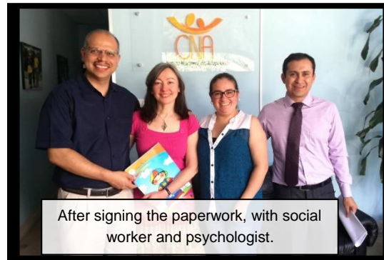
After signing the paperwork, with social worker and psychologist.